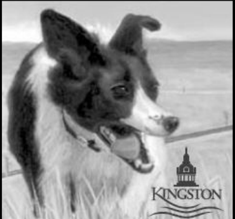
20th Anniversary Kingston SHEEP DOG TRIALS & Canadian National Championships